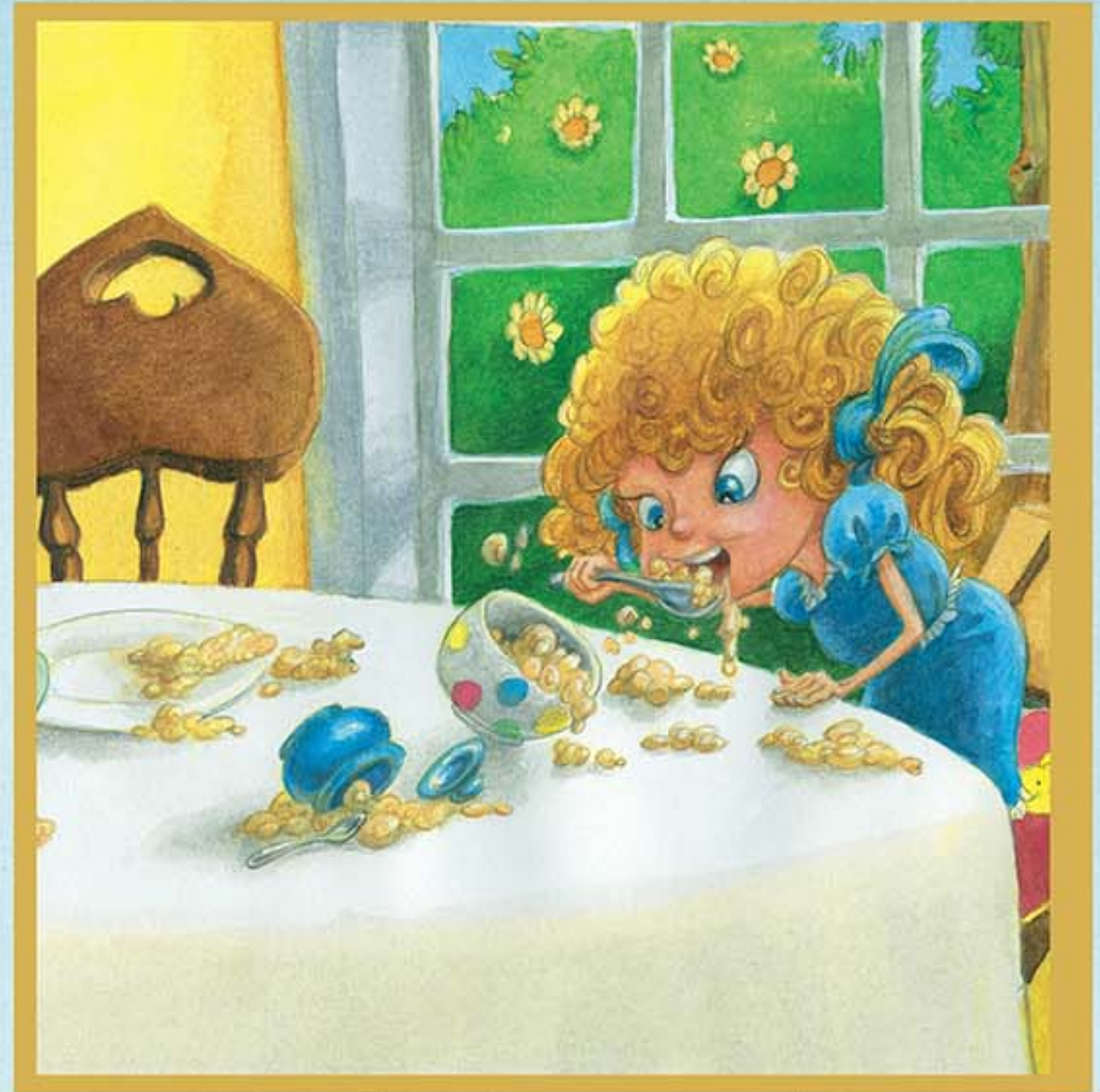
1. Chair back 2. Spoon 3. Green dot turned yellow 4. Extra flower 5. Squirrel

If Goldilocks wrote a letter to the Three Bears, what do you think she would say?