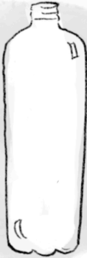
An empty, clean plastic bottle (1 litre)