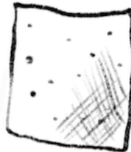
A piece of fabric