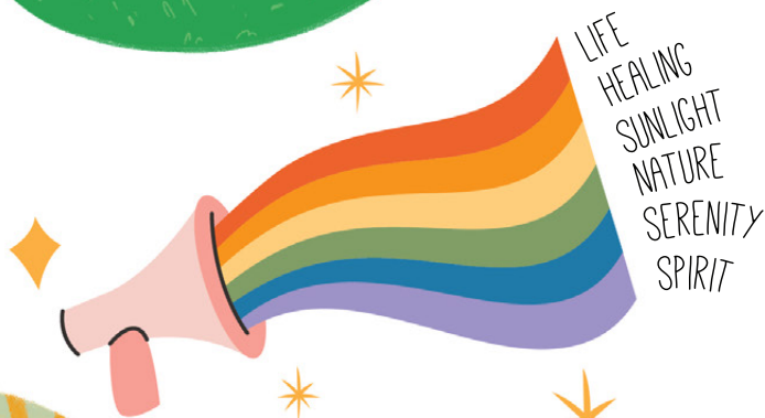
Billie Jean King